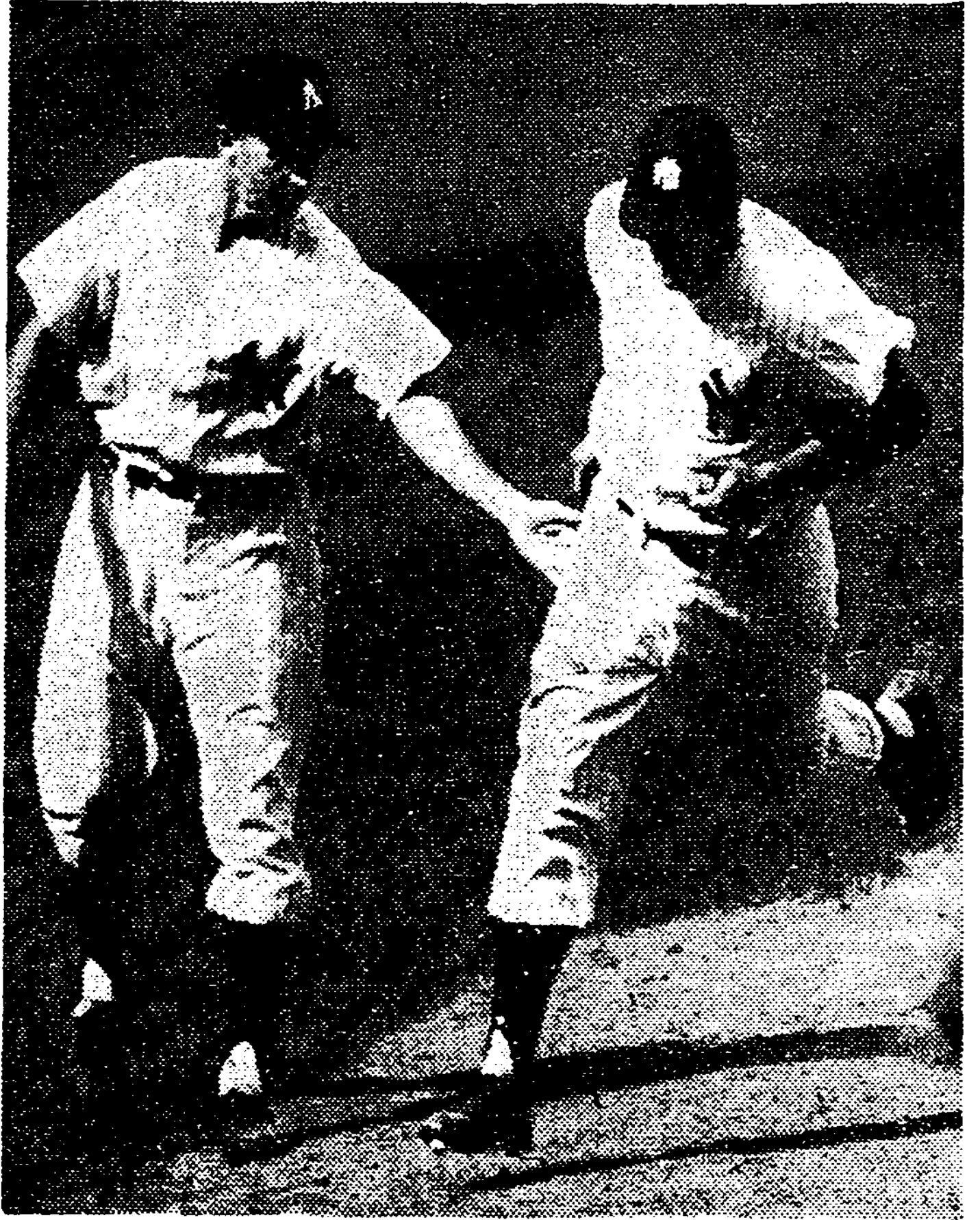
Frank Crosetti, third base coach, gives Bill Skowron a congratulatory pat as Skowron collected his seventeenth homer, a drive into left field bleachers, in eighth inning.