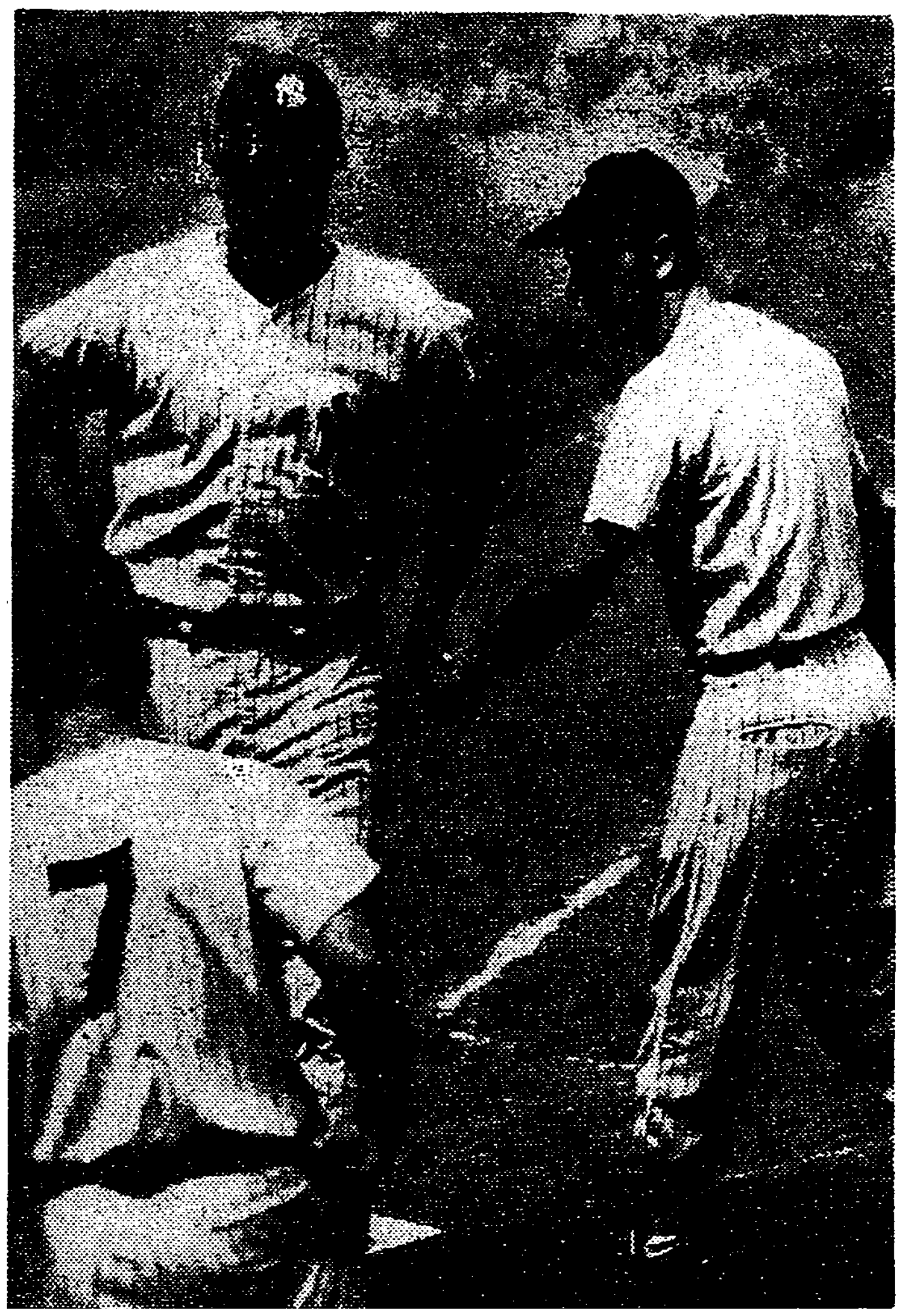
Elston Howard is welcomed at the plate by Mickey Mantle and bathoy after his four-bagger in the second inning.