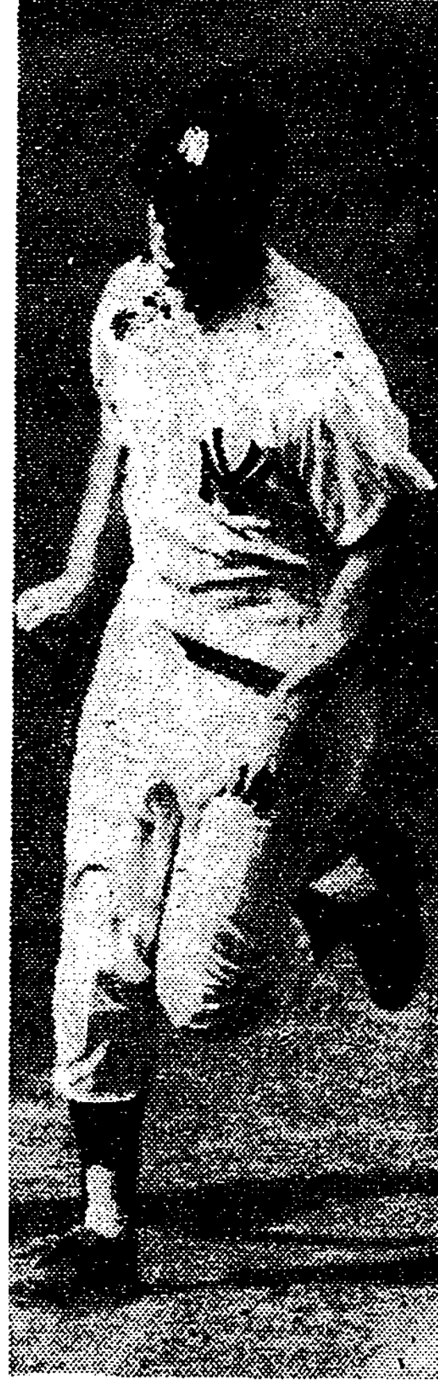
Mickey Mantle on his way to completing the circuit in the eighth inning.